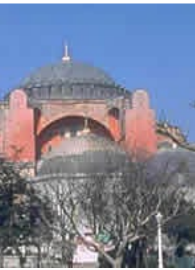
Figure 8. Exterior of the Hagia Sofia mosque, Istanbul, Turkey.