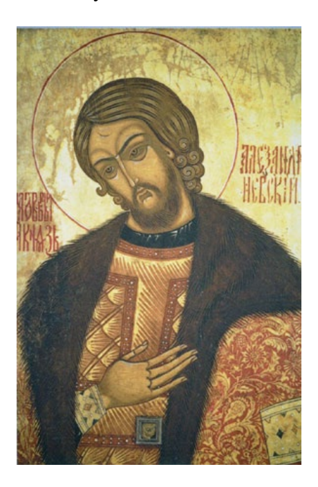
Figure 11. Russian Prince, Saint Alexander Nevsky.

Pope Gregory IX instituted the Papal Inquisition and showed no mercy to the Greek schismatics. However, the Pope's crusading hordes were met in Russia by the resistance of Prince Alexander Nevsky.