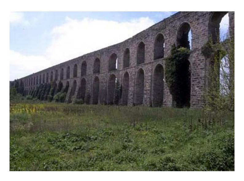
Figure 6. Roman water aqueduct in Istanbul, Turkey.