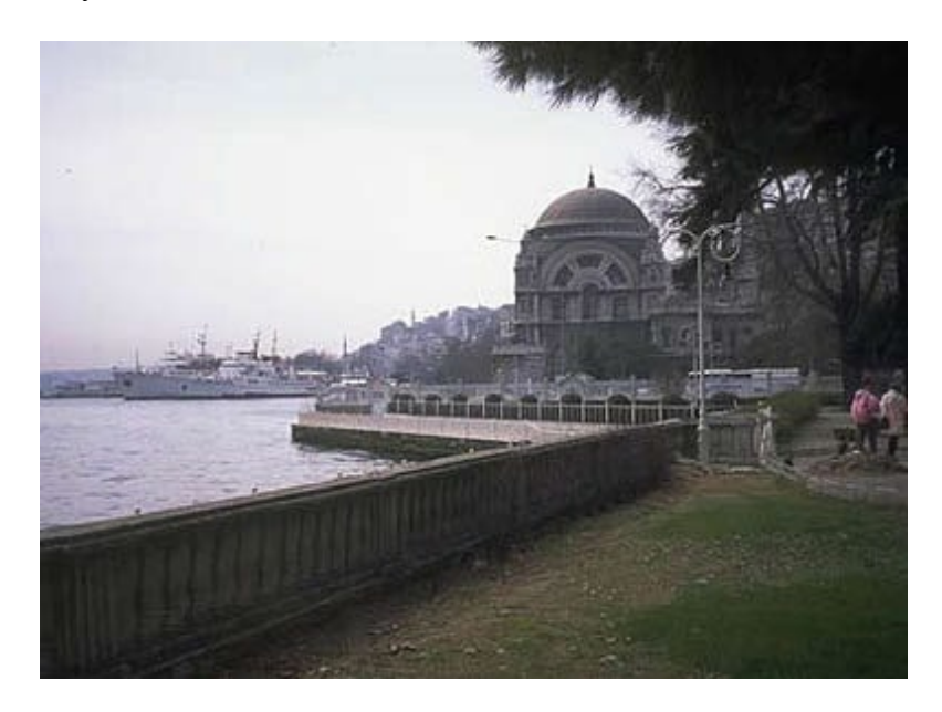
Figure 5. The Dolmabahce Mosque, Istanbul, Turkey.

The Dolmabahce Mosque is another major landmark and was built in the midnineteenth century and is located southwest of the Dolmabahce Palace.