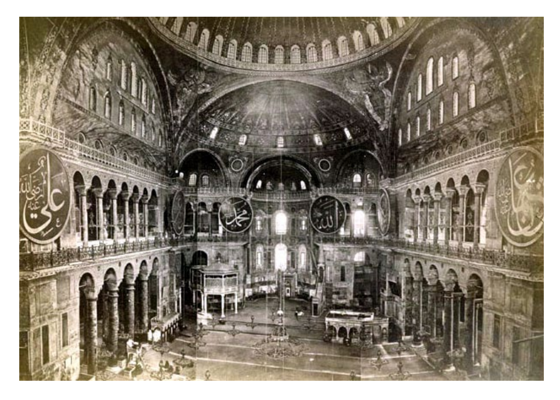
Figure 9. Interior of the Hagia Sofia. Initially converted into a mosque, since 1935 it has been preserved as a museum.