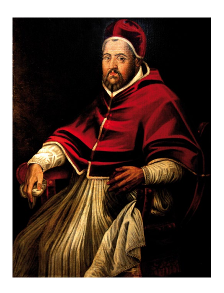
Figure 13. Pope Clement VIII

Moscow replaced Constantinople as a bastion of Eastern Christianity or as a Third Rome. It became the focal point of the Western hatred of Orthodox Christianity. The next western strike was launched in 1595.