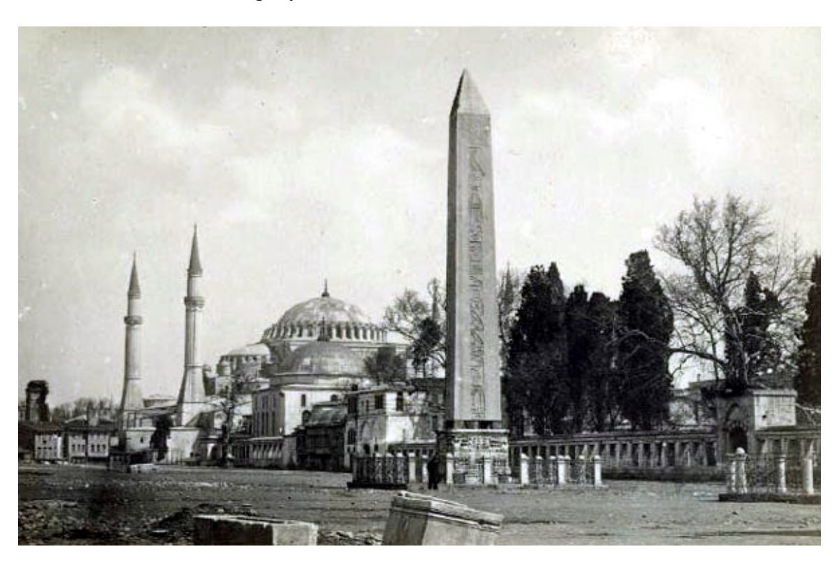
Figure 4. Egyptian Pharaoh Thutmose III Obelisk at the Hippodrome Park, Istanbul, Turkey.

The Hagia Sophia is Constantinople's most famous landmark and one of the most famous buildings in the world. It was the city's cathedral and the site of a church originally built by Constantus, son of Emperor Constantine the Great. The original church was burned down in 532 AD and the present church was built between 532 and 537 AD under the supervision of Justinian I. The original dome fell after an earthquake and the current dome is slightly different in architecture.