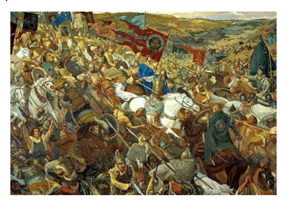
Figure 12. Encounter between Mongols and Russians.

By 1242 the Mongol army had captured all of Russia. Its leader, Batu Khan chose Old Sarai, in the lower Volga, to establish the headquarters of the Mongol dominion over Russia, which became known as the Golden Horde. The Golden Horde, as a center for the Mongol administration of Russia, endured for almost 250 years. A daruga handled Russian political affairs and the collection of an annual tribute.