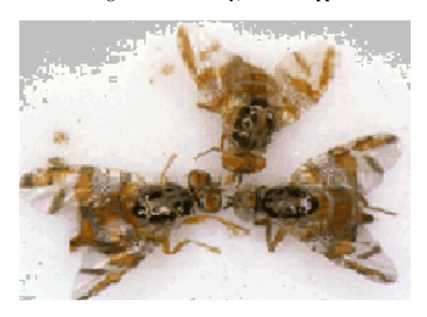
Fig. 3: Mediterranean Fruit Fly, Medfly, Ceratitis capitata.