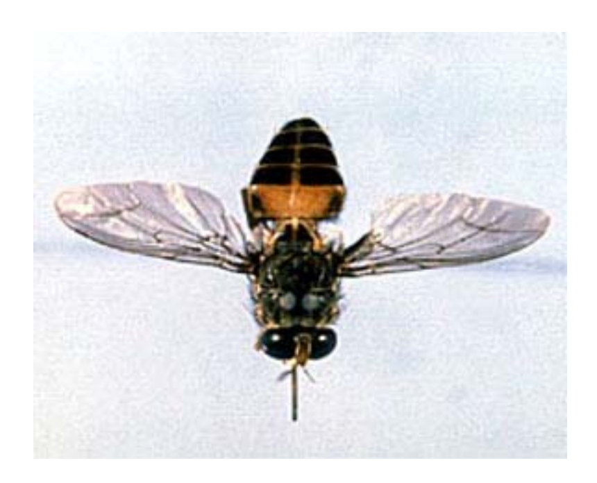
Fig. 2: The Tsetse fly, Glossina spp.