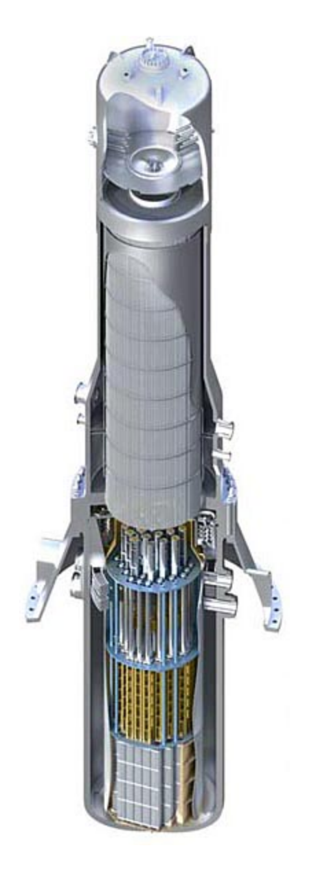
Figure 3. Integral configuration of core and steam generator within the reactor vessel of the modular reactor.